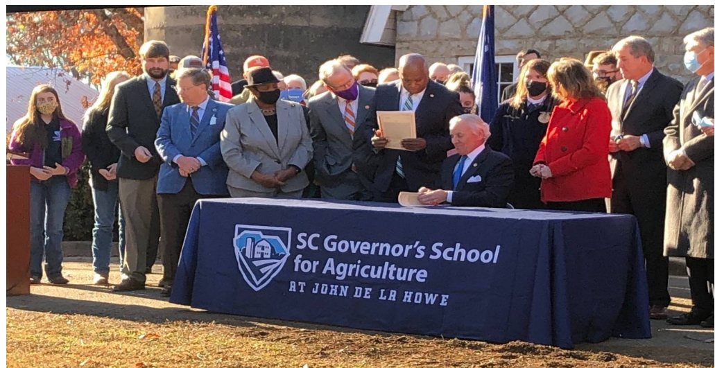
Governor Henry McMaster signs the bill which designated the Governor's School for Agriculture at John De La Howe.

The bill also creates a Development Office for the Governor's School for Science and Mathematics, located in Hartsville, S.C. The Development Office will raise support for an endowment fund.